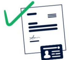
Medical Exemption together with photo ID