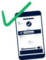
COVID-19 Digital Certificate via the Service Victoria app