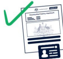
Printed copy of Immunisation History Statement together with photo ID