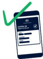
COVID-19 Digital Certificate saved to smart phone